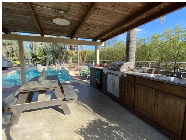
Covered Patio, BBQ and Pool area