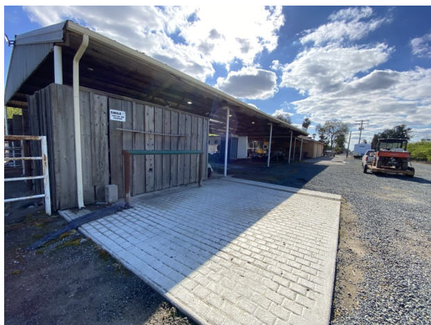
Wash Rack and Pole Barn