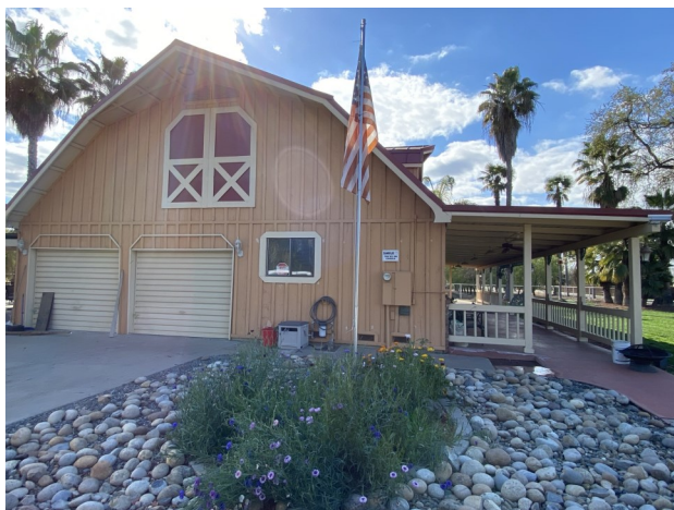
Garage side of home